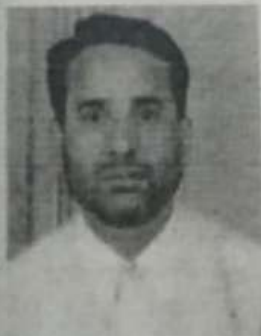
Photograph of the Candidate